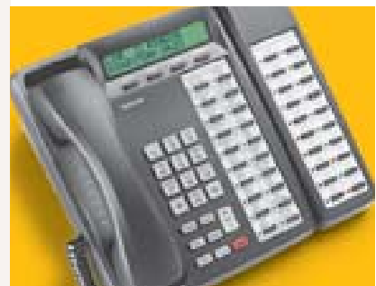
20-button 2-Line LCD Digital Speakerphone with Optional Add-on Module

Your operator can quickly answer and transfer calls using our 20-button LCD digital speakerphone equipped with an optional 20-button Add-on Module or 60-button DSS Console, depending on the number of telephones and lines you have.