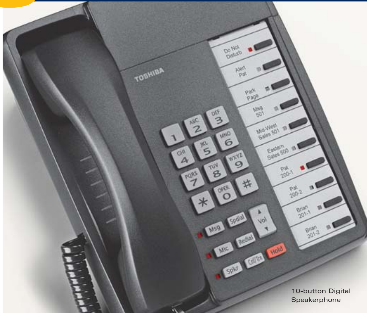
10-button Digital Speakerphone