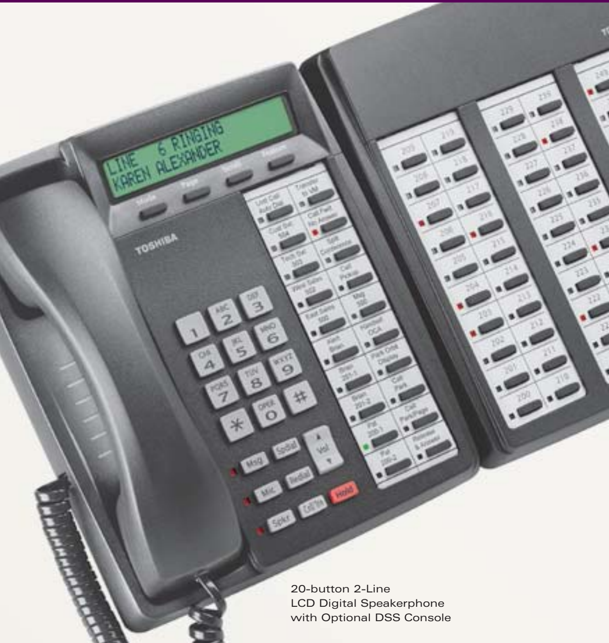
20-button 2-Line LCD Digital Speakerphone with Optional DSS Console