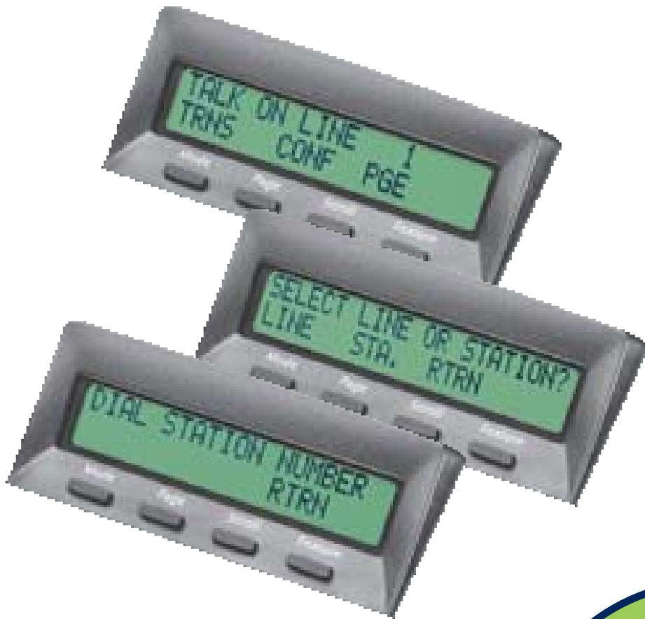
20-button LCD Digital Speakerphone