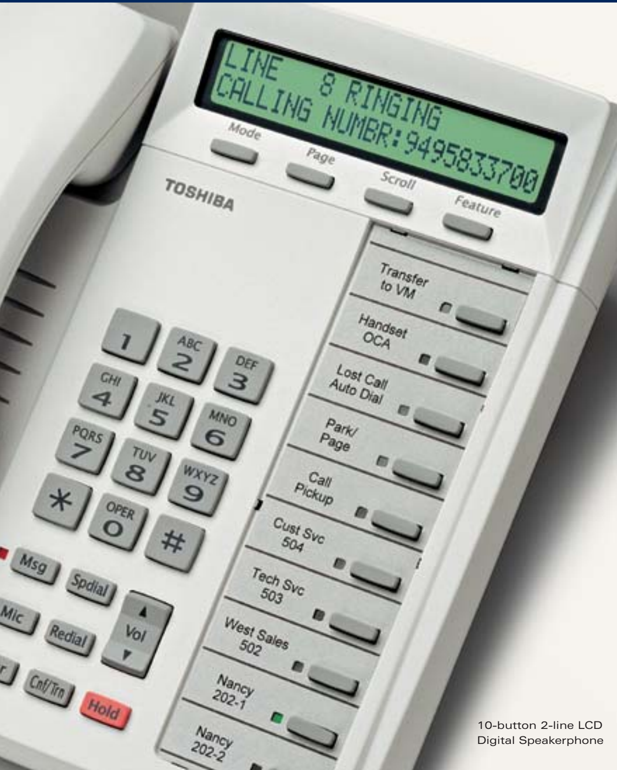
10-button 2-line LCD Digital Speakerphone