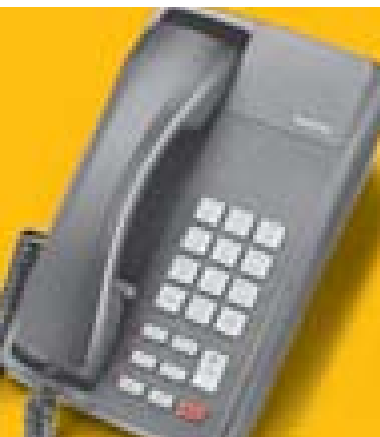
Single Line Digital Telephone

All Toshiba telephones are ergonomically designed with easy-to-reach, easy-to-read feature buttons. You can even perform several feature-operation sequences by pushing a single button, saving valuable time.