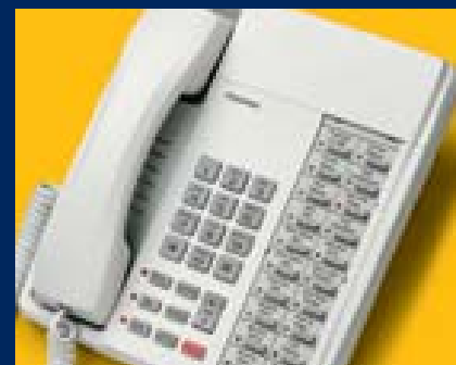
20-button Digital Speakerphone

Our 10-button and 20-button Speakerphones provide full functionality for all types of calls. And their state-of-the-art technology allows you to converse via the speaker as effectively as if you were using the handset! In addition, the full-duplex speakerphone model with external microphone is a valuable tool for conference room and demanding, high-performance speakerphone applications.