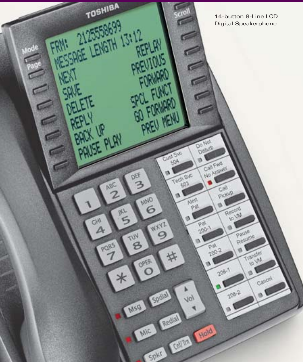
14-button 8-Line LCD Digital Speakerphone